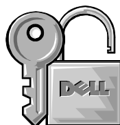
Figure 1. Complete Dell Setup Icon (Not Present on Some Computers)

If you do not see the Complete Dell Setup icon on the desktop, no action is required.